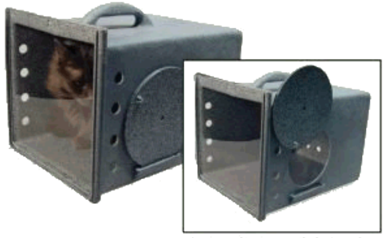
Shown with open porthole (inset).