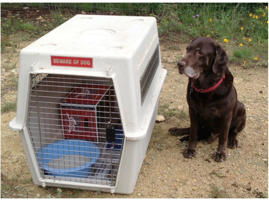
A relocation crate and an adult male chocolate lab to show scale

No matter what crate you use, it should be large enough to humanely house two adult cats. A 42" or larger Midwest crate does nicely.